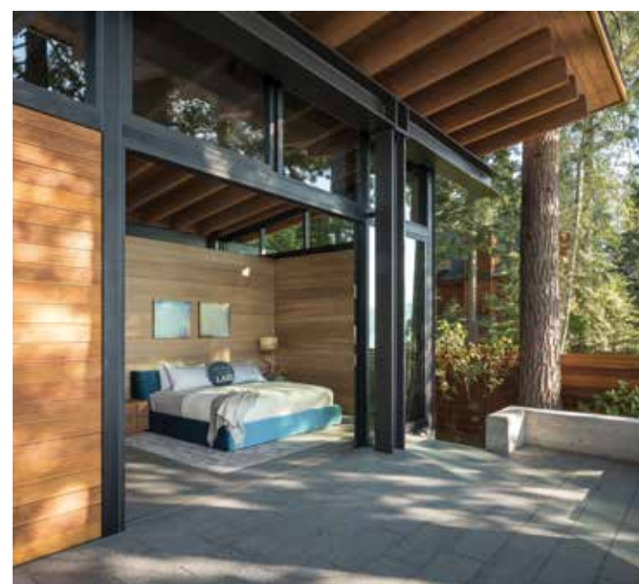
THIS PAGE CLOCKWISE FROM TOP: The built-up roof was constructed using clear span re-sawn rafters that are sitting on heavy gauge steel I-beams spanning 91 feet. Installed by Vertical Iron Works, the steel structure supports the roof load and allows the large sliding glass door opening | The primary suite has its own 15-foot-wide sliding glass wall that allows easy access the lakeside patio | The 10-foot-tall entry pivot door served as the datum point of the entire house—where the exterior walkway leading from the garage to the home precisely lines up to the center of the great room and lakeside patio doors OPPOSITE PAGE FROM TOP: The office has custom scraped walnut floors along with T&G knotty cedar ceilings to provide the room with some warmth | Bentwood walnut cabinetry with integrated matte black pulls by Truckee Tahoe Lumber Design Center create clean horizontal lines