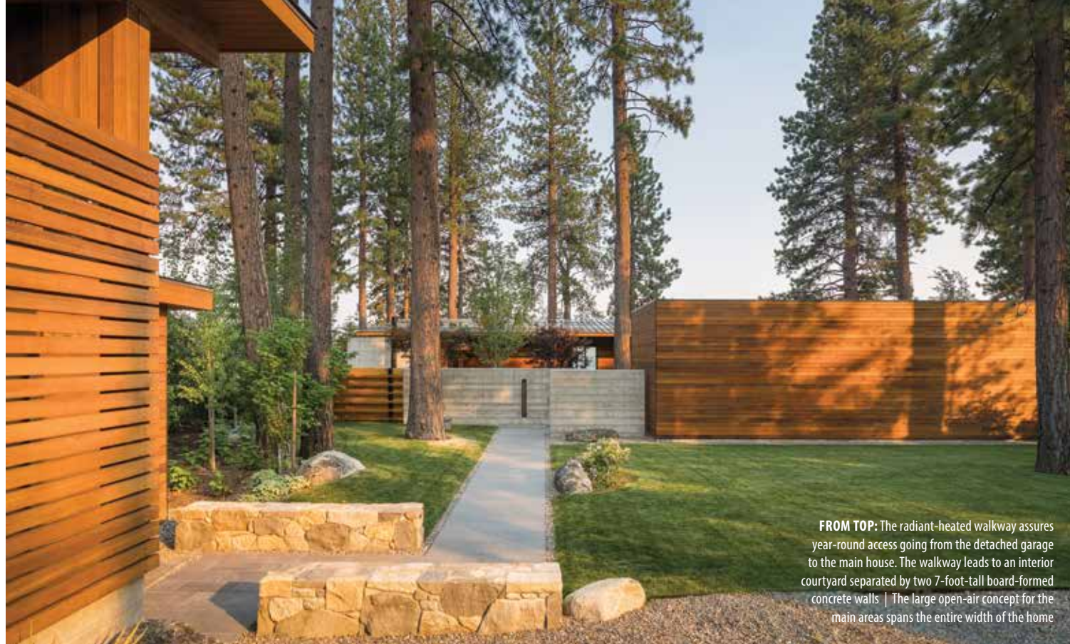
FROM TOP: The radiant-heated walkway assures year-round access going from the detached garage to the main house. The walkway leads to an interior courtyard separated by two 7-foot-tall board-formed concrete walls | The large open-air concept for the main areas spans the entire width of the home

In addition to the family's former and current Tahoe homes, Shawback has designed other projects for her clients over the years. She literally watched the girls grow up, and now that they are all college-age and older, the family wanted to give them space that reflects their current life stage. Each of the daughters now has her own private bedroom with en suite bathroom. The parents can enjoy the 84-foot-wide home if it's just the two of them, "or they can bring on the family and really enjoy that house right on the water," Shawback says.