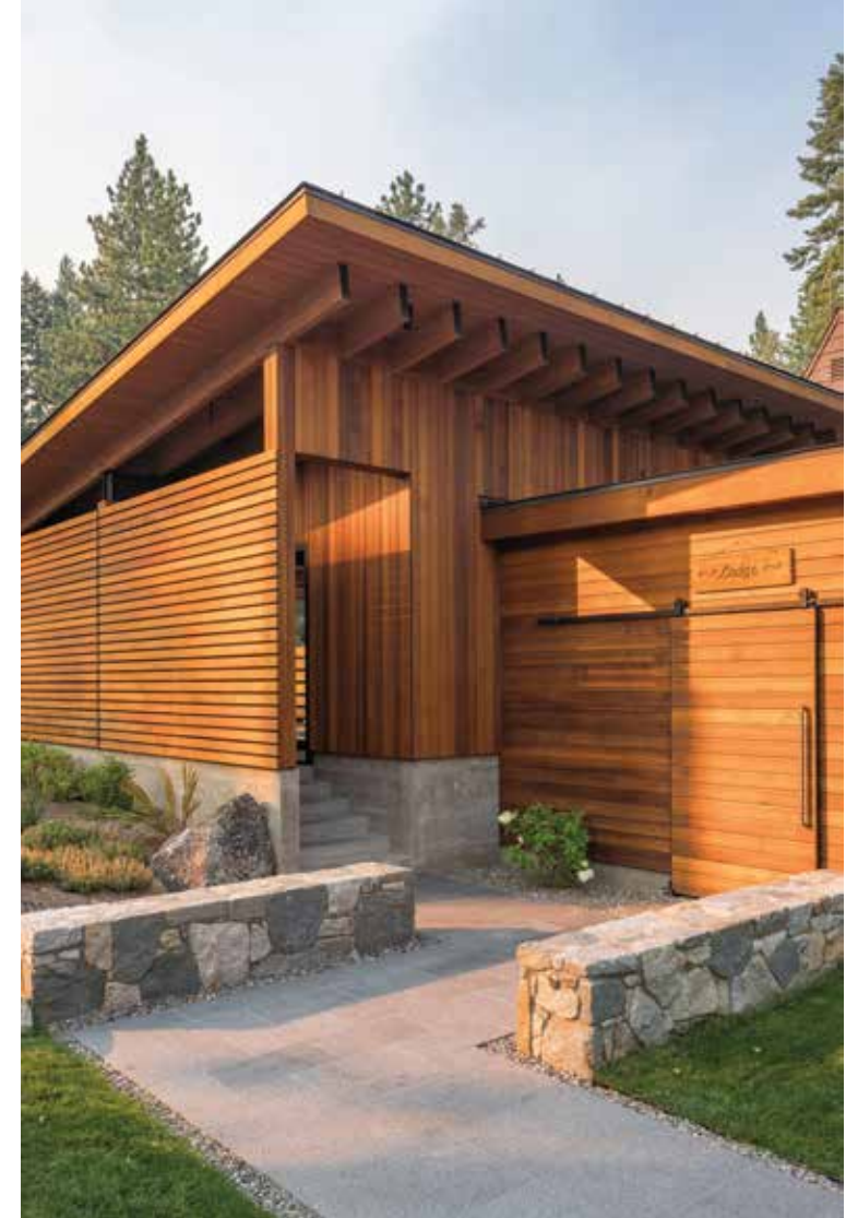
FROM TOP: Alongside the detached garage, horizontal custom-milled cedar boards with 3/4-inch spacing were used as an open-air privacy wall that delineates the entry breezeway and exterior courtyard | An elevated view of the 84-foot-wide home from the shoreline of Lake Tahoe showcases the expansive glass walls and interior finishes

Details mattered greatly to these owners, who asked that there be no transitions—no step-downs or steps—when coming into the house from the back patio. They didn't want to see gutters, so the channels for moving water were integrated into the roof itself. They also wanted to avoid notching in the siding around the